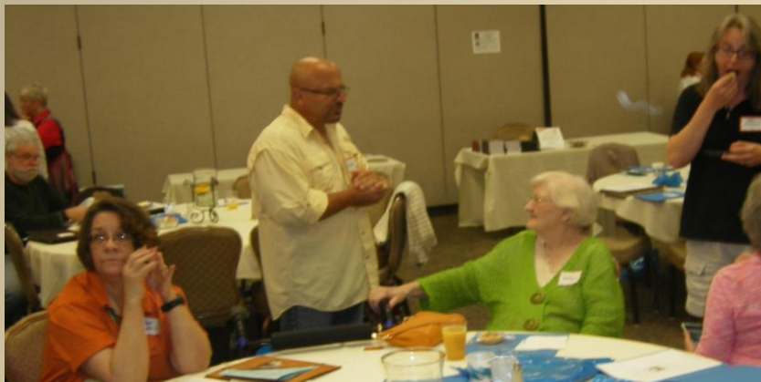
This was our 21 st Annual Conference.