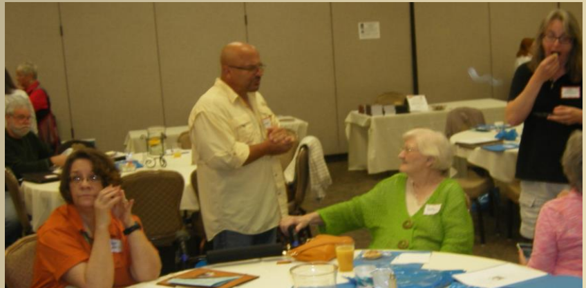
This was our 21 st Annual Conference.