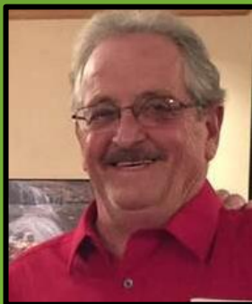
Gary Rodgers will have a short story published in Saddlebag Dispatches.